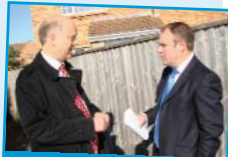
Conor Burns discussing local anti-social behaviour issues with Shadow Home Secretary Chris Grayling MP in Poole.